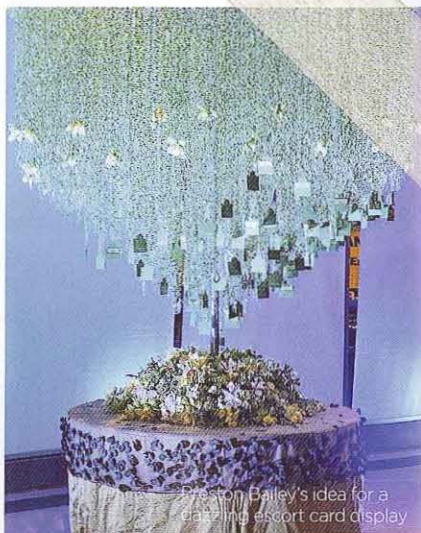
Preston Bailey's idea for a dazzling escort card display

Forget saving the best till last: set the tone for your celebration with flair and dazzle right from the word go. 'Escort arrangements are taking on a new twist,' says celebrity florist and event planner Preston Bailey ( prestonbailey.com ), whose clients include Oprah Winfrey, Donald Trump and Uma Thurman. 'This table is the first thing guests see, so it's a great place to make a design statement. Think: boughs of pearls and crystals, with place cards floating in mid-air held only by gossamer ribbon.'